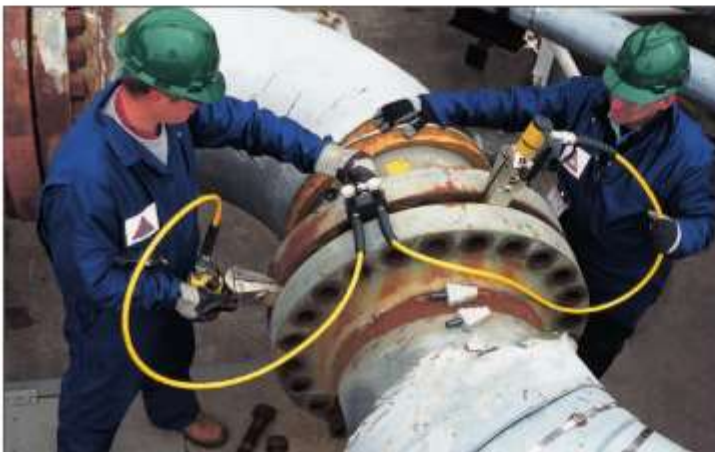
◀ Two FSH-14 spreaders used simultaneously with Enerpac handpump, hoses and AM-21 control manifold.

Secure-Grip and Zero-Gap flange spreading tools for application on flanges with a zero or small gap.